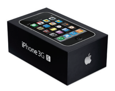
iPhone 3GS U.S. retail packaging is 28 percent lighter and consumes 23 percent less volume than that of the previous-generation iPhone 3G.