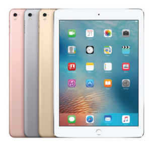
Date introduced March 21, 2016